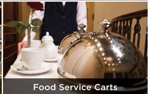
Food Service Carts

1600 Bishop St, Cambridge, ON N1R 7N6 P: (519) 623-9420 F: (519) 653-8772